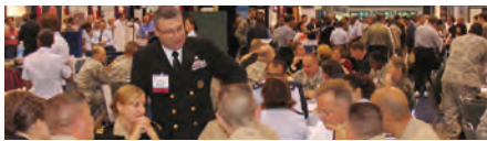
Exhibit Hall Opening — $15,000

The Welcome Reception serves as the JFPS 2019 “kick off” for all